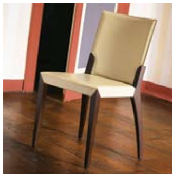
nora chair: ivory leather + wenge base, 17.5" w x 19.5" d x 33" h

63"/72"/79" (closed)...93"/102"/116" (open)