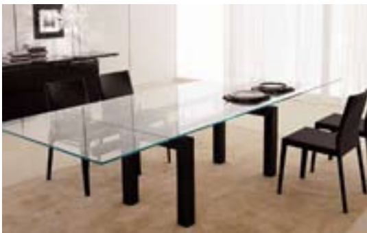
hartford table: matte black base + clear glass top (open position) | shown with CAT beverly chair