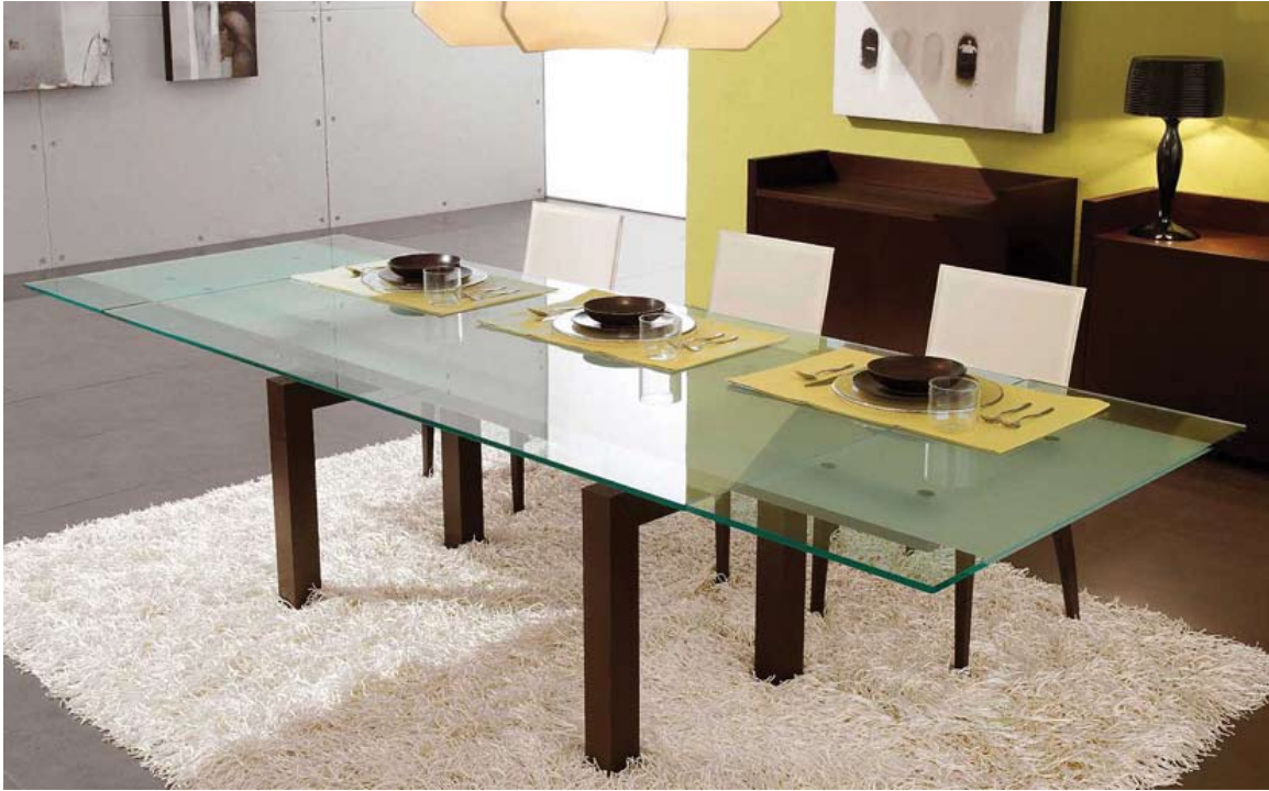
hartford table: wenge base + mixed glass top (42" w x 79" l / ext. 116" l x 29.5" h) | shown with nora chair in ivory leather + wenge base,