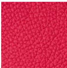
red leather textile