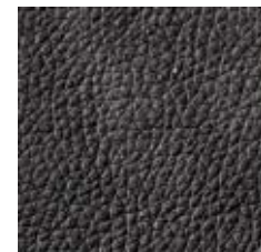
black leather textile

The Frame Sleep Sofa attracts immediate attention with its unique design and multiple functions. The adjustable back rest can be set in sofa, lounge or bed position, and the two sides of the seat (the wings) can be raised with a simple click. Upholstered with high-quality pocket springs and foam, and clean cut legs in brushed stainless steel. Sleeps 1 1/2 in the bed position. Designed in Denmark, proudly made in China.