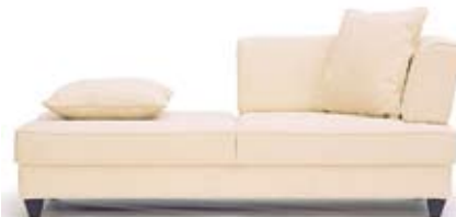
claudio sofa: offers incredible versatility