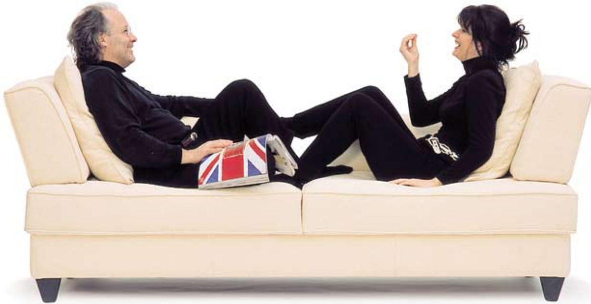
claudio sofa: 83"w x 36"d x 35"h